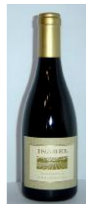
Noble Sauvage 2002 - our most recent offering.

Our sticky is always a favorite and we will be very pleased to release our '06 offering next year..... Ah, a light at the end of the tunnel.