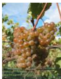
Riesling ripening in Block 2.

At Isabel we are always researching new ways to ensure that our practices are environmentally sustainable. For twelve years now, the marc (left over stems and skins of pressed grapes) is returned to the vineyard soil as mulch. This organic cycle eliminates wastage and provides the vines with much needed nutrients for healthy growth and fruit production.